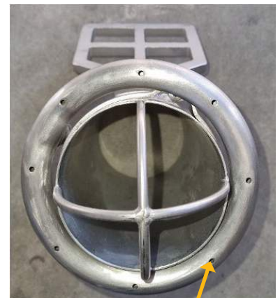
Jetter ring nozzle holes